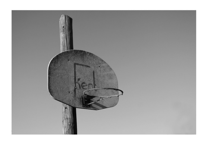
Hoop With No Net -digital\ photography Brett Curtis