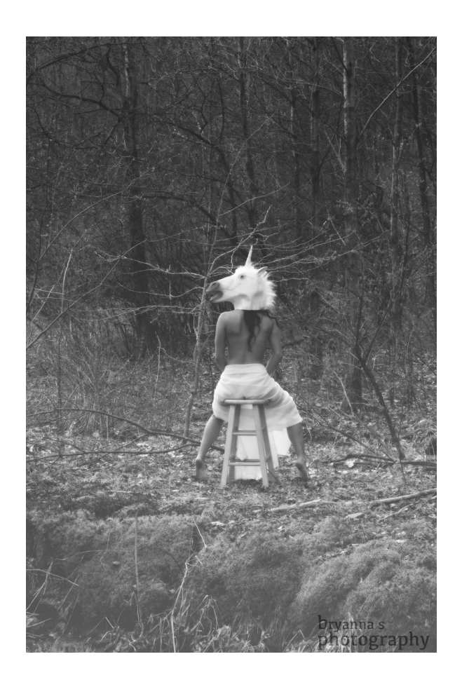
Unicorn — digital photography Bryanna Stahlman

The bejeweled blue peacock unfolds its green, lacy feathers and dragon-swoops from a tree.