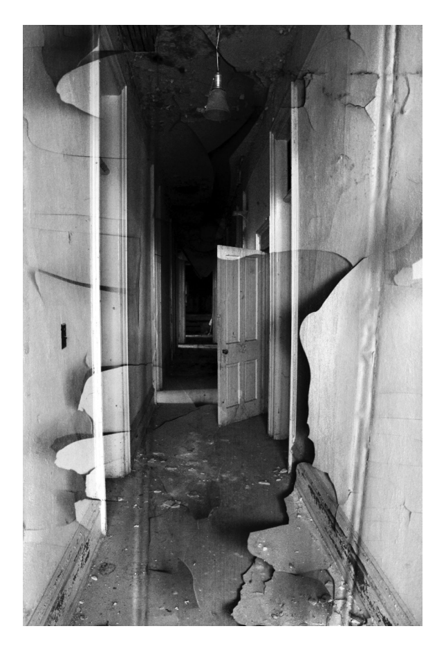
Light

and I let you suck the life out of me fully until there was nothing left. But your smell is tempting and every time you call I pick up the phone, no hesitation, because I love my cigarette laced with poison gas.