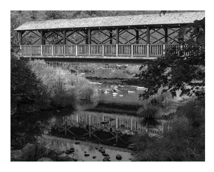
Adventure -digital\ photography Jordan Darrow

Our secret swimming hole: we'd meet there every hot day, all summer. A deep pool in the Tunungwant, next to the old airport. Cool water, a deep green, dappled shade on both sides. A lush private place, hidden by big trees. We'd swim, while blue herons flew over, landing downstream. They'd fish and watch us. We didn't know they were special, we thought they were everyday birds. We were just kids swimming and kissing where our moms couldn't see.