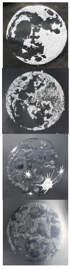
Crystal Moons \, -sugar, borax, and epsom salt solutions on black cardstock \, Amy \, Gaberseck