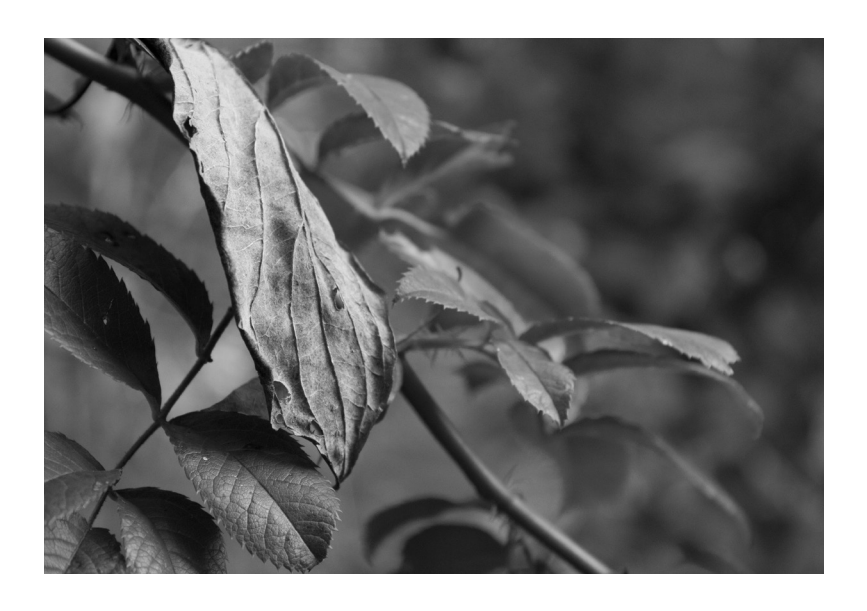
\begin{array}{ll} \hbox{Holding On } - \textit{digital photography} \\ \hbox{Austin Stephens} \end{array}

We remember their love when they can no longer remember. -Unknown