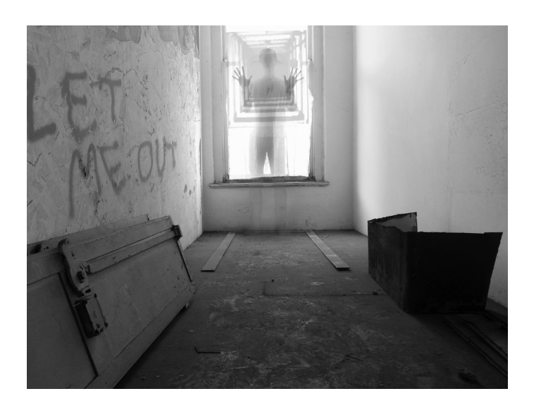
Forever Living 5 — digital photography Bryanna Stahlman

Across the night it echoed, a whisper caught on the spine of the wind that whispered secrets between the pines in the voice of some wild thing. It slithered in the frozen grass and loosed leaves from their tallest towers. It crept between the rocks and the water that snapped at the bramble banks and gave speed to the wings of ebon-feathered beasts who croaked back into the deep black and fell silent before something called back.