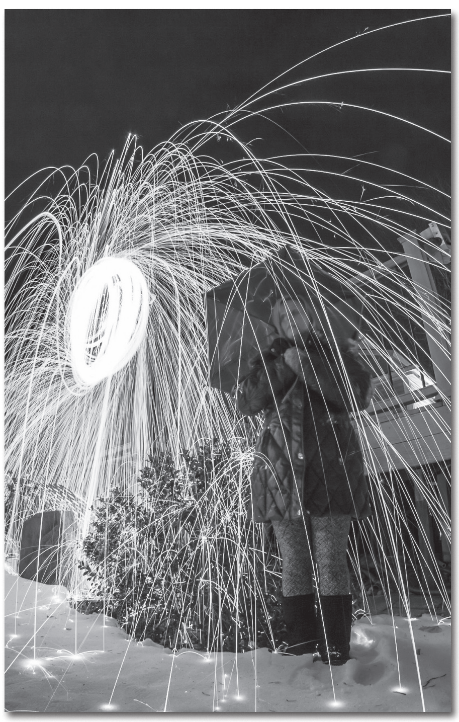
\begin{array}{ll} \text{Untitled} & -\textit{digital photography} \\ \text{Matthew Brahaney} \end{array}